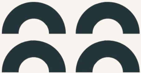
Activity program (draft)